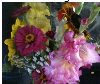
Bouquet picked at the Gardens 2011

Peter and Jane Good will once again invite you to visit beautiful gardens on Sunday's from 2pm until dusk in August.