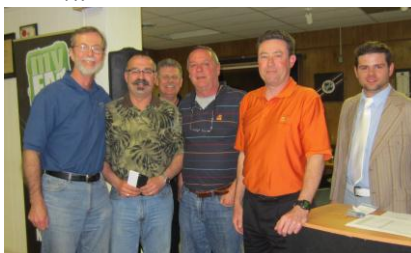
Trivia Night Winning Team